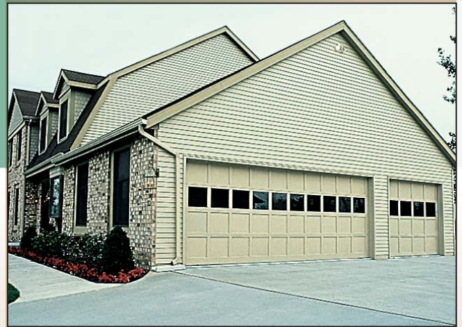
Colonial Wood Panel Garage Door

Good styling endures, and so does quality construction. Both make the Colonial door a prudent investment for your home. Colonial doors are made from high-quality, kiln-dried Western woods in sizes and styles to complement a range of architectural designs. Your choice of a Colonial wood panel door will keep rewarding you year after year.