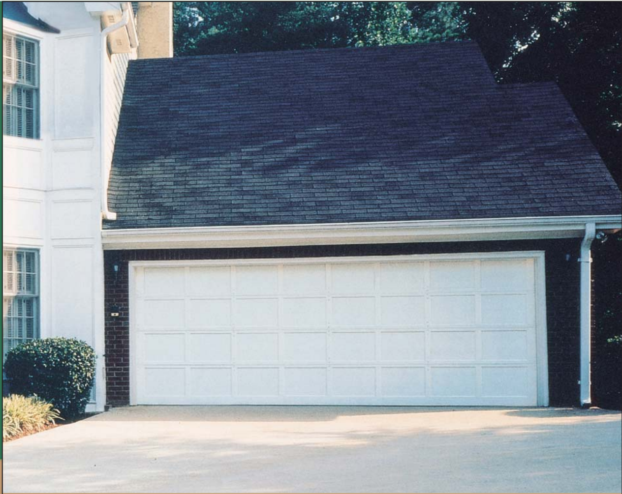
Colonial wood panel garage door

The warm look of traditional wood panel doors