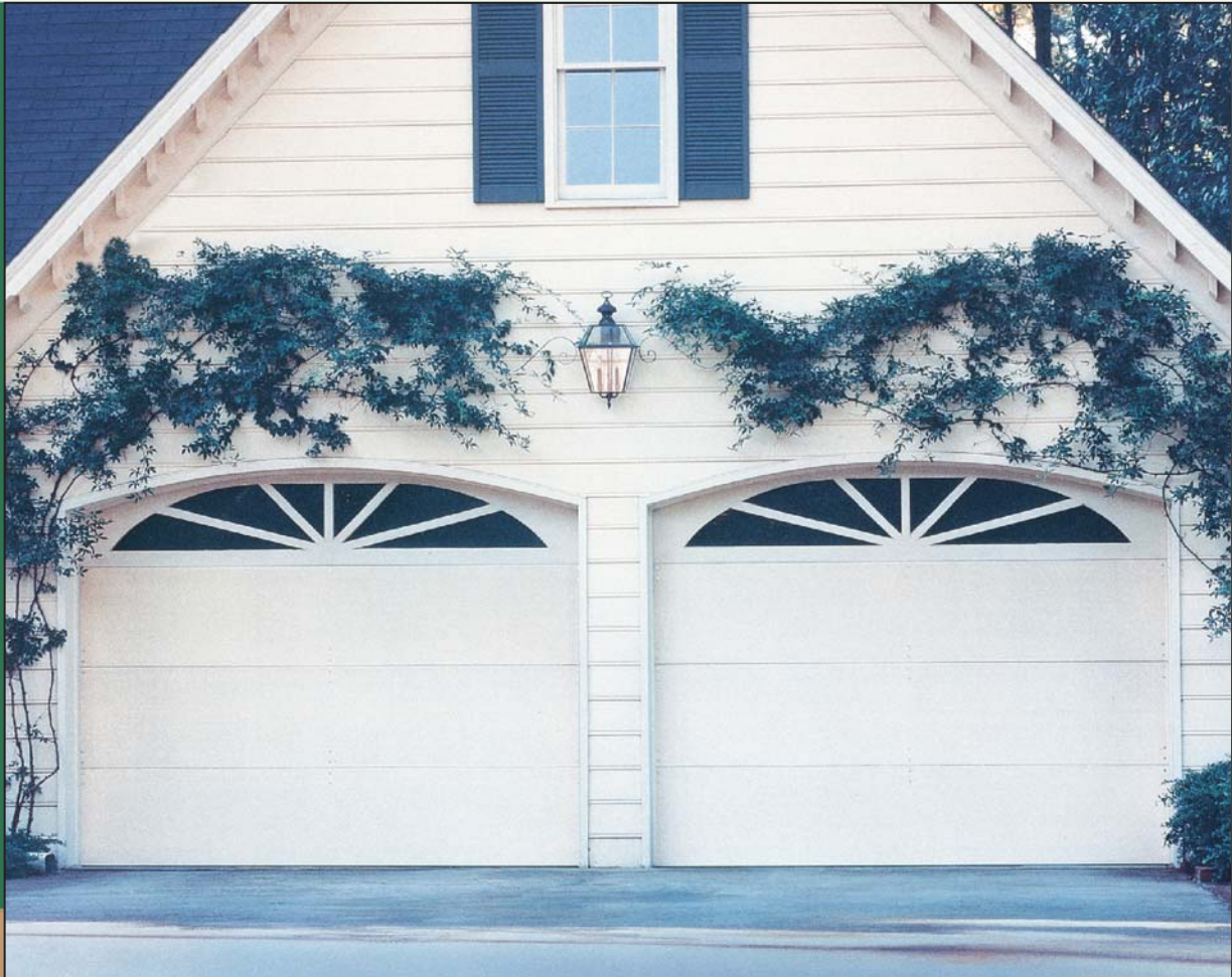
Model 40 double-flush wood garage door.

Flush wood garage doors to match traditional and contemporary style homes