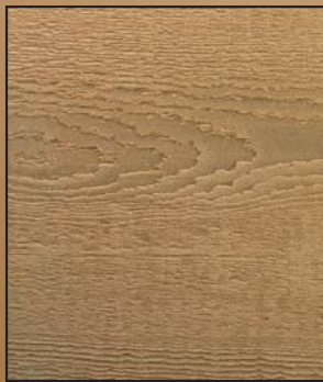
Model 43 rough-sawn cedar hardboard

With their wide selection of styles, windows and accents, our flush style wood doors complement both traditional and contemporary exteriors. Quality materials and expert craftsmanship give your home an appealing appearance that's easy to live with for many years.