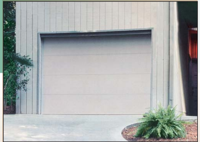
Model 40 Flush

The double flush wood door offers many choices in styles, textures and options to make it your idea of a garage door. Constructed from high quality, kiln-dried Western woods with polystyrene insulation core, double flush wood doors complement a broad range of architectural designs.