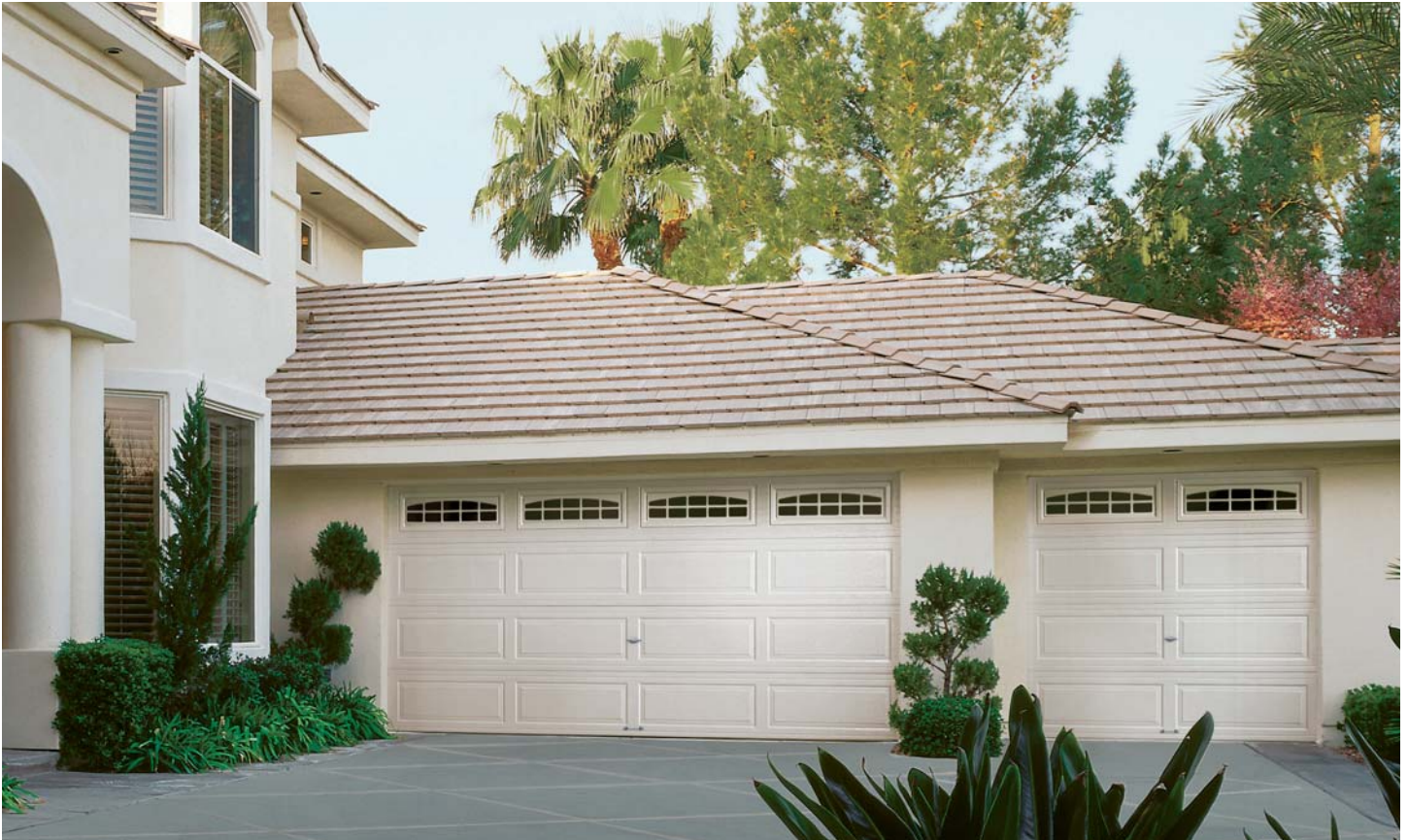
Model 8300 shown in Ranch design with Cascade II window inserts